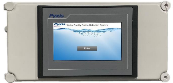
Figure 1 UC-100A Display + Data Logging Terminal

The Pyxis UC-100A is a microprocessor-based touch screen display and data logging terminal that can connect to up to 4 Pyxis sensors via RS-485. The UC-100A will be preconfigured by Pyxis Lab based on the Pyxis sensor utilized and enables rapid deployment and startup. The UC-100A provides live display and historical data trend charts for each sensor input as well as sensor calibration interface while logging data for of all inputs via USB download or transmission via Modbus RTU and/or Modbus TCP. The UC-100A may be installed as a stand-alone device or directly wired to any receiving controller, PLC or DCS network. Users may also purchase UC-100A with integrated Pyxis CloudLink 4G Gateway with or without a prepaid global SIM card, making the UC-100A a comprehensive data gateway to cloud data acquisition and service programs for live mobile visibility, data download and reporting. The UC-100A also comes equipped with two extra 4-20 mA inputs, outputs that can be used to log data from non-Pyxis analog device.